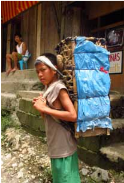
Image 7. Child miner delivering supplies. Mt. Diwata, Compostela Valley