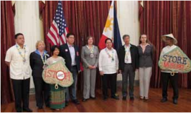
Image 1. US DOS Project Launch with DENR Official, US Embassy Staff and Ban Toxics at US Embassy, Manila.