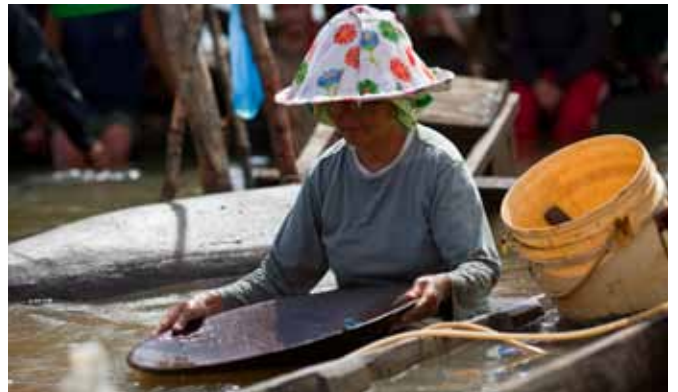
Image 6. Woman panning in the river, Camarines Norte.