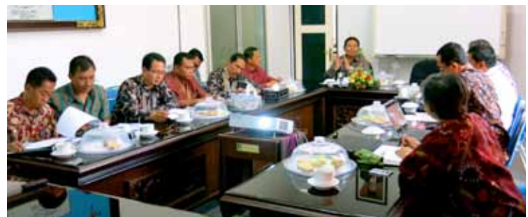
Fig. 8. BaliFokus presented the findings and results of the mercury monitoring in several spots and discussed it with local stakeholders of West Lombok Regency to develop the Local Action Plan to eliminate mercury and improve the ASGM practices.