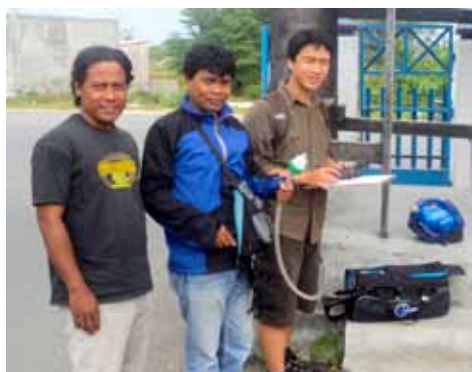
Fig. 5. Ban Toxics staff trained BaliFokus staff how to operate the Lumex.