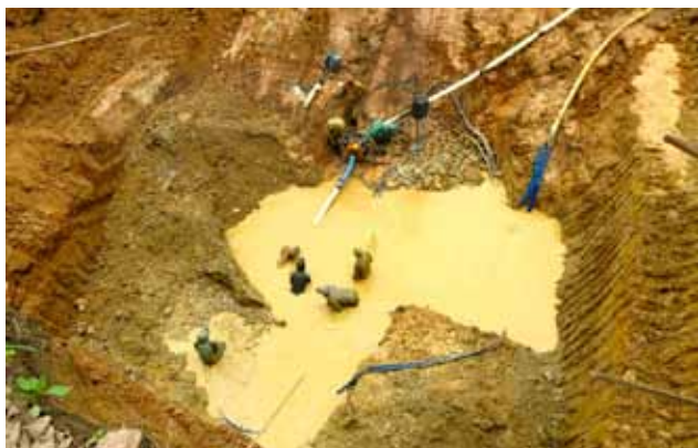
Fig 3. Sucking the earth to get gold using water jet/ compressor