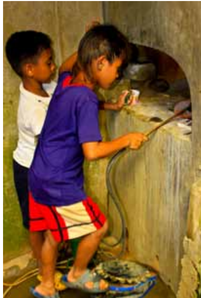
Image 8. Children burning amalgam, Mt. Diwata, Compostela Valley.