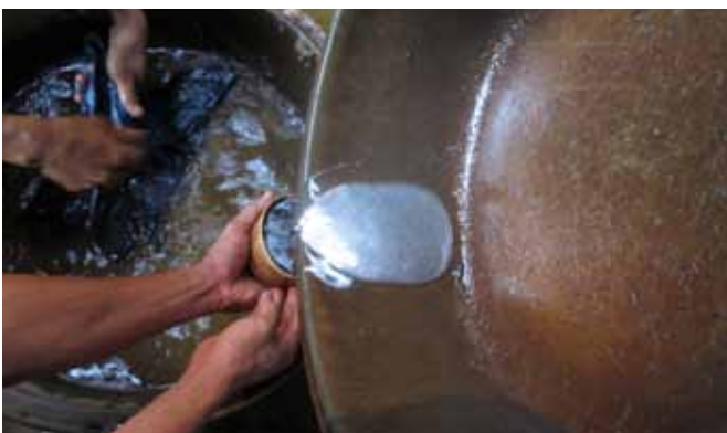
Image 3. Gold amalgamation during panning, Camarines Norte.