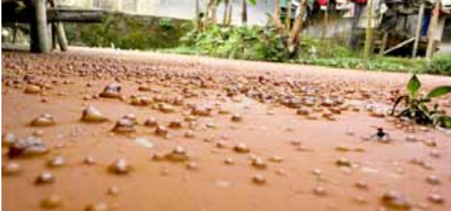
Fig. 1. Mercury contaminated pond in Cisitu Village, Lebak Regency, Banten Province. Community discharged the processed water from the ball-mills into the fish pond.