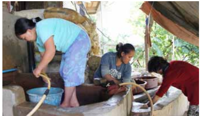
Image 5. BT Women miner training. Women are given hands-on training by BT trainers.