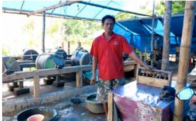
Fig. 2. A miner in Bombana, Southeast Sulawesi, member of a kongsi, used 7 kg of mercury per day to produce 20 gram of gold