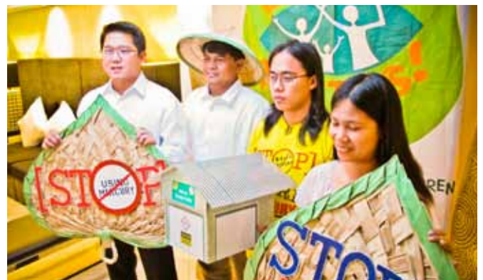
Image 18. BT Storage Consultation in Quezon City with City Mayor Herbert Bautista, left.