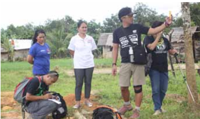
Image 17. BT Team conducting Lumex Hg vapor sampling in the field. Kalinga.