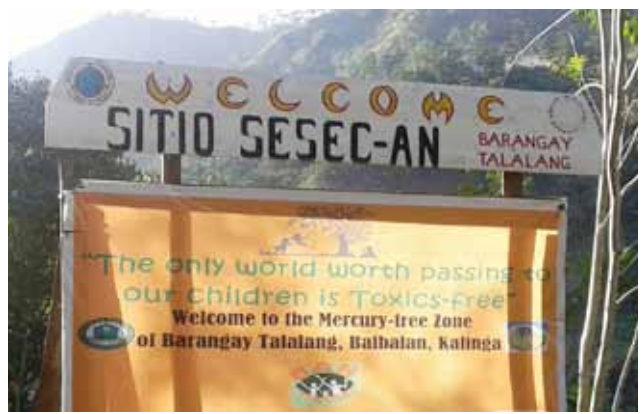
Image 13. Village of Sesecan embraced BT's Hg-Free advocacy and declares their mining village a Hg-Free Zone.