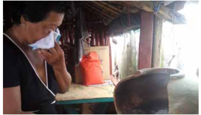
Image 4. Woman burning amalgam. Women are usually tasked to burn the amalgam. Camarines Norte.