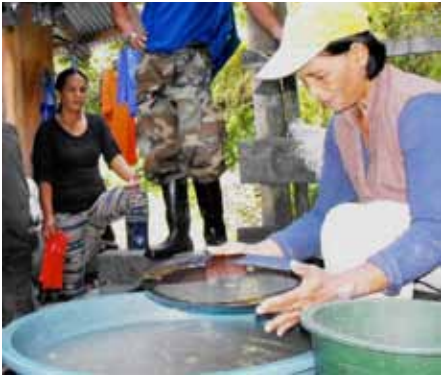
Image 14. Woman burning amalgam. Women are usually tasked to burn the amalgam. Camarines Norte.