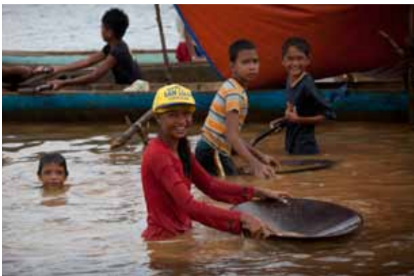
Image 10. Children panning in the river. Camarines Norte.